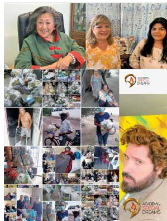
The Academy of Special Dreams supports both national and international efforts to make an important impact on families facing difficulties during this pandemic in collaboration with many friends and families.

be free of discrimination or bias to enjoy self-determination, to pursue a meaningful career, to contribute to society, and to be part of a loving family. In this country, life for many people living with disabilities, whether physical, intellectual or other, has improved since the ADA became law. For people with disabilities in countries like Mexico and Central America, it is a daily battle to just be recognized as part of