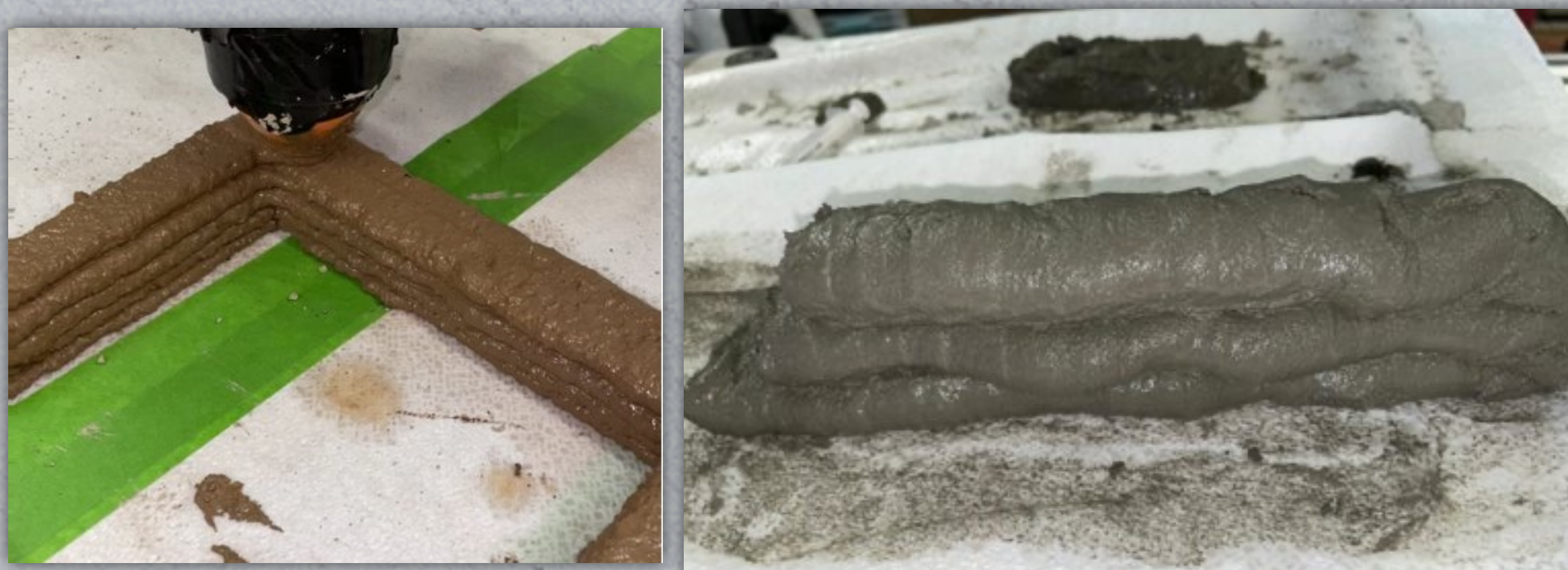
Figure 4: Several layers printed consecutively with different cementitious mixtures which exemplify the printer's capabilities

To conclude, the results obtained was to allow a print of several layers over another the improvements to the 3D printer are the new Extruder which contains a longer logger to allow more mix to come out at a constant rate. The Reservoir was design to hold more volume per load and the High Flex pump will be attached to the extruder to allow the passage of the concrete mixture. The gantry obtained a bracket attachment which will stabilize the load in the Z-axis and will avoid any vibrations that the gantry system may obtain. The team also determined on the printer being ready to be raised to its full length.