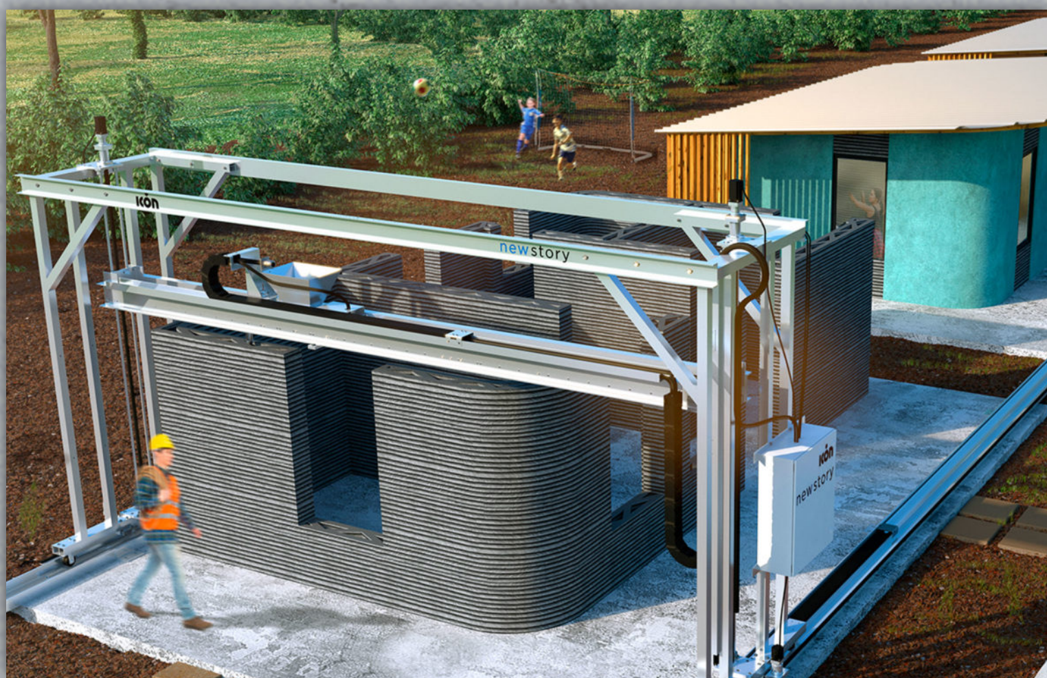
Figure 1: Rendering of possible uses for a cementitious 3D Printer

Cementitious printers allow for structures, such as houses, to be built quicker and less expensively than traditional methods while also requiring minimal human labor. Cementitious 3D printers are capable of printing single and multiple layers, and patterns, to create complex geometry not possible by traditional methods.